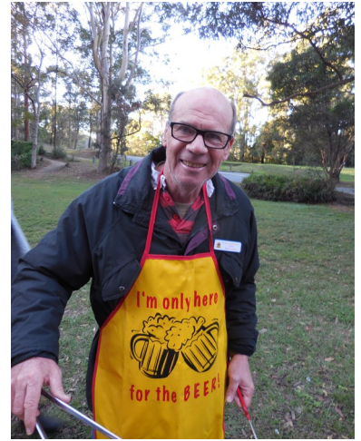
Photoes from last BBQ , Ironbark Gully