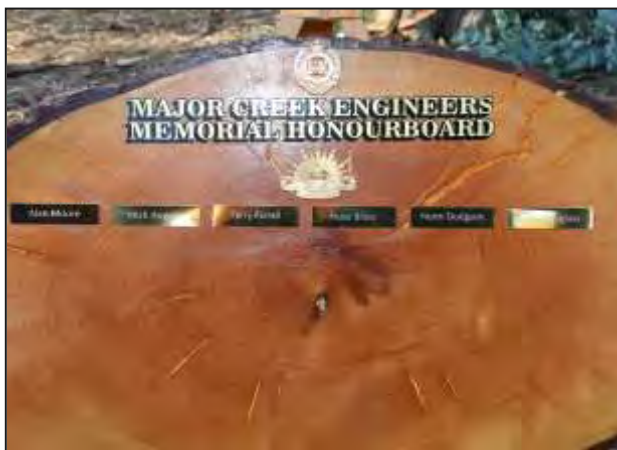
Honour Board displayed for the first time.

at the end. There was a good number of caravans and assortment of tents.