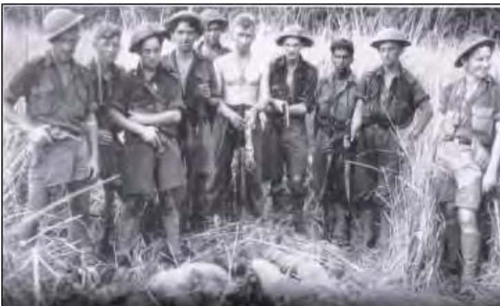
Left: Australian soldiers in PNG pose behind Japanese dead, with a mixture of British and American small arms.

http://www.abc.net.au/4corners/stories/s12899.htm