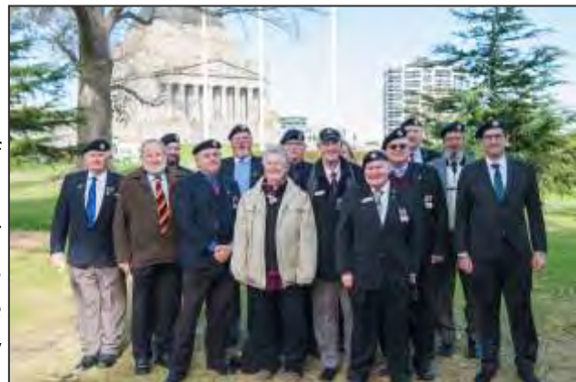
Sappers on Parade—Reserve Forces Day 2017