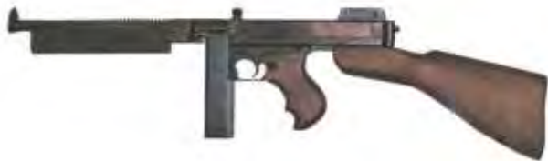
Above: US supplied Thompson Sub Machine Gun M1