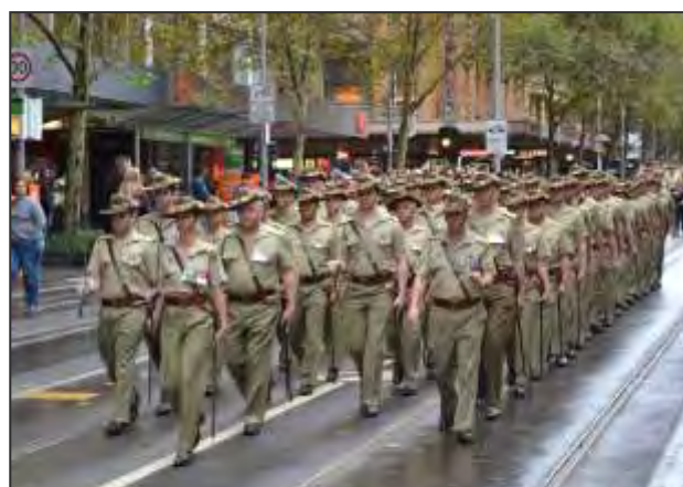
Above: 22 Engineer Regiment on parade—ANZAC Day Melbourne 2017