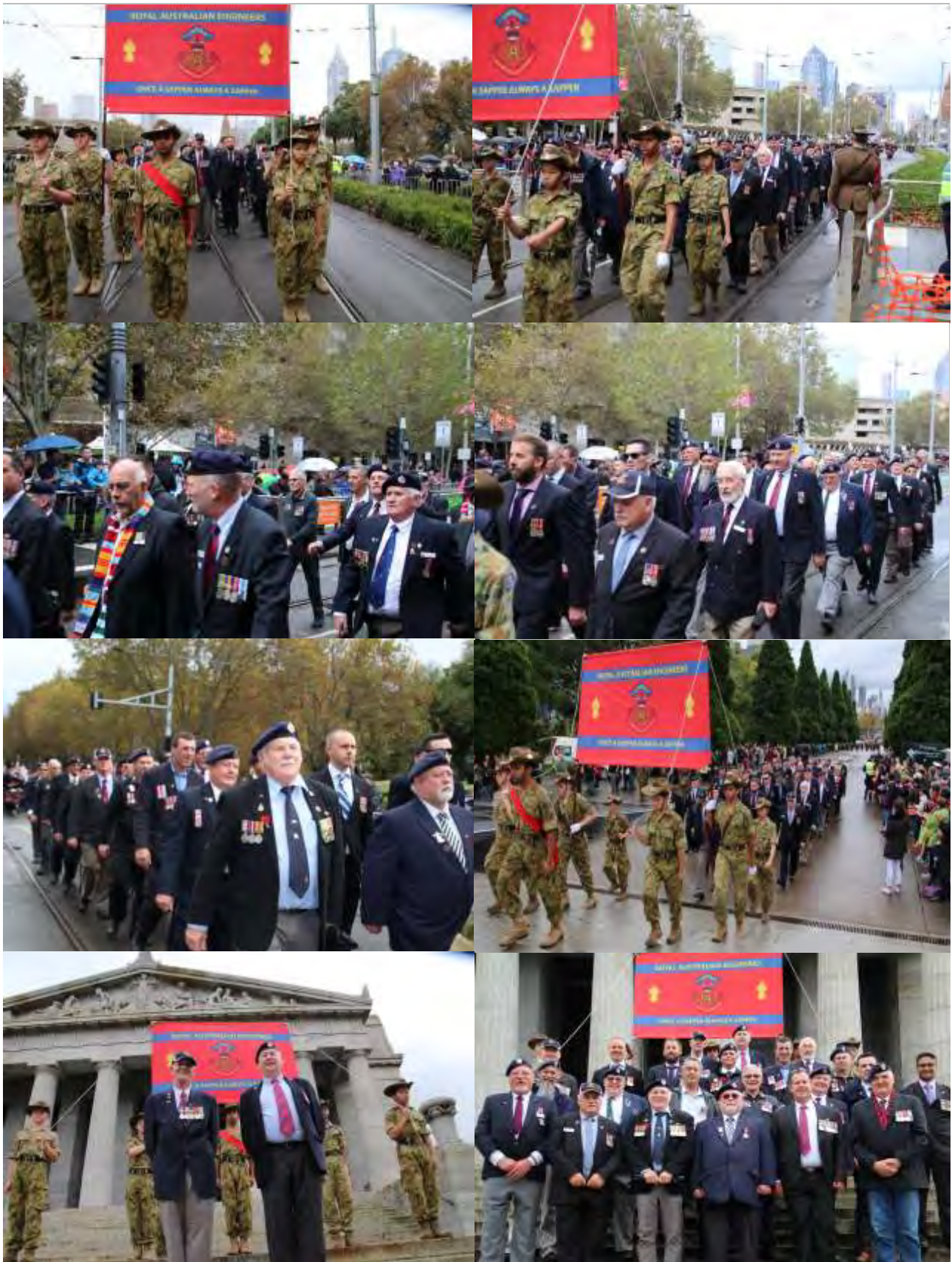
Above: Royal Australian Engineers Association – Victoria ANZAC DAY 2017 MELBOURNE