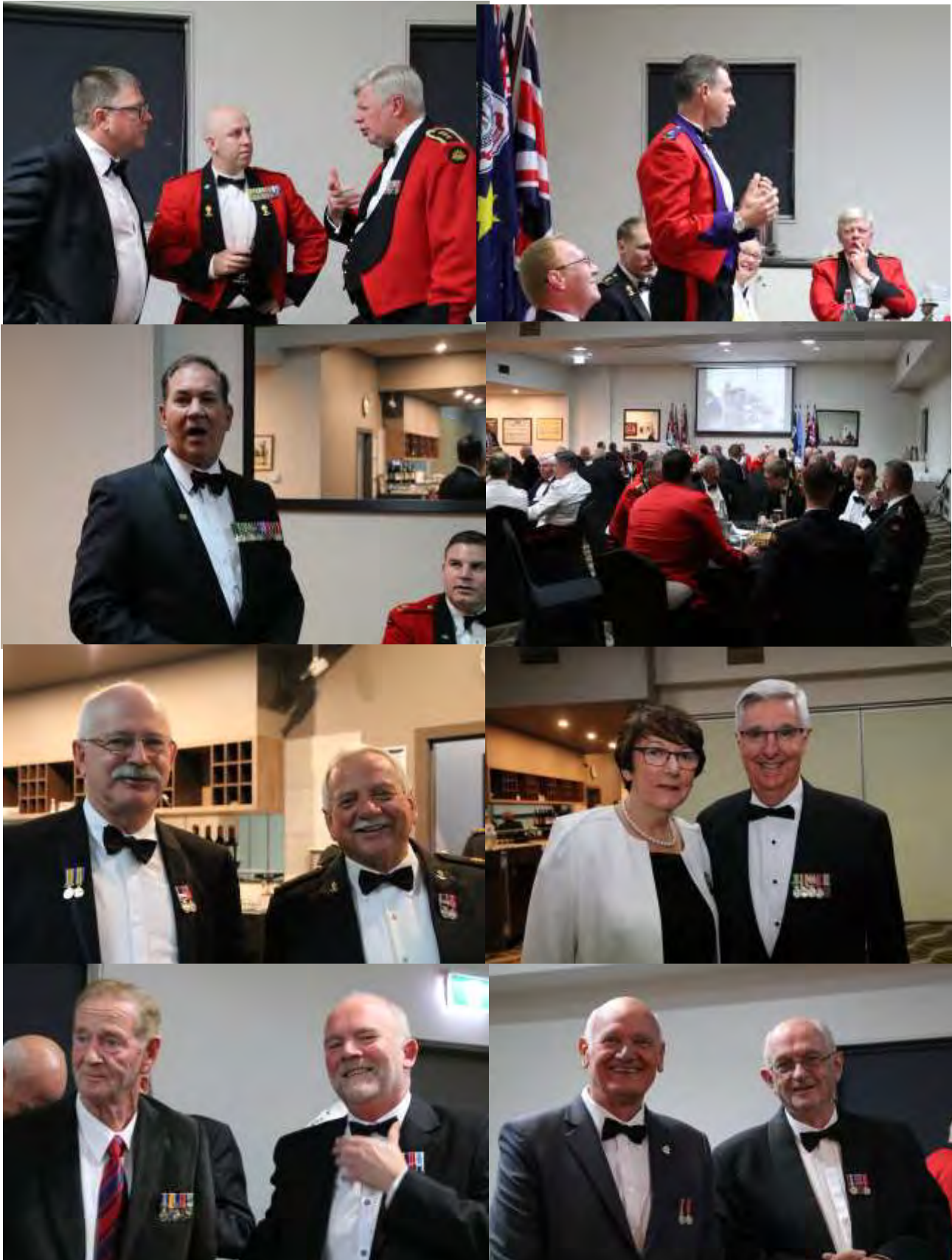
RAE WATERLOO DINNER 2017 RINGWOOD RSL HOSTED BY 22 ENGINEER REGIMENT