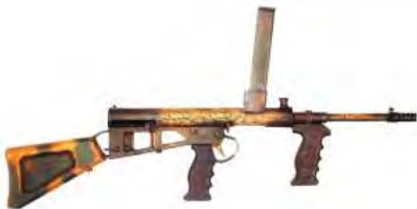
Above: Owen Sub Machine Gun

Born out of the inadequacies of the SMLE for jungle fighting conditions and the need for a light, dependable, short range, manoeuvrable and high rate of fire weapon, the Australian designed and manufactured Owen Gun became a favourite amongst Australian troops in the South West Pacific Theatre.