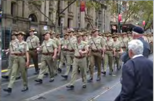
Above: 22 Engineer Regiment ANZAC DAY 25 April 2017 MELBOURNE